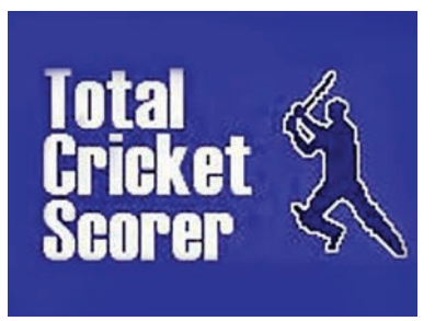
Pro Cricket Scorer Software